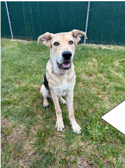
← Otis finds his “forever” home. See page 1.