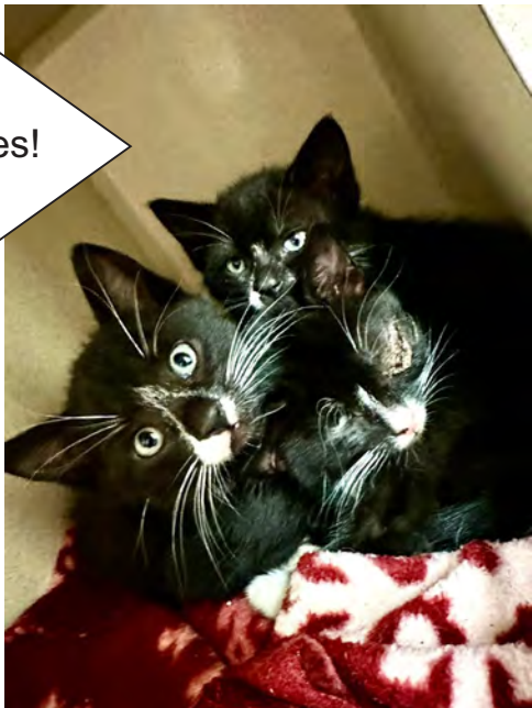
Captain & his siblings need homes! See page 7